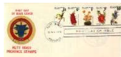
Hutt River Province cover

Cedric Roché showed local stamps of Hamburg (Germany), Hansa Company, Horsens (Denmark), Horten (Norway) and the Principality of the Hutt River Province (Western Australia).